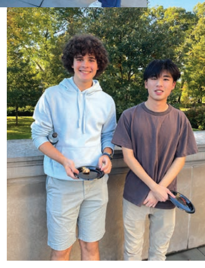
Students were all smiles as they took a break from classes—enjoying some great food and camaraderie with friends new and old.